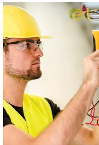
Enhanced safety during maintenance