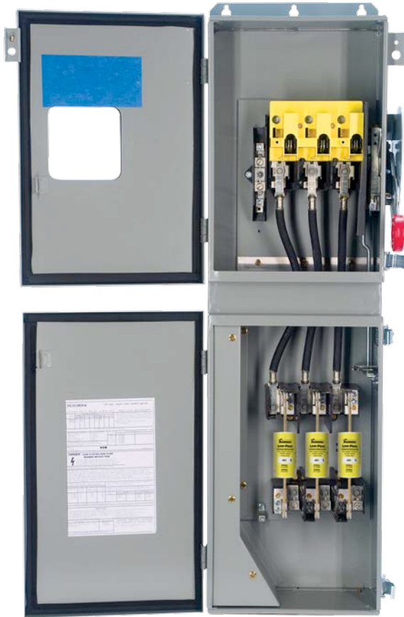
Note: 100 A device shown. Fuses not included.

Eaton's double-door line isolation switch is the industry's first compartmentalized fusible safety switch, and the latest product in Eaton's expanding offering of enhanced safety switch devices. The revolutionary two-door design includes an internal barrier that separates the upper switching compartment from the lower fuse compartment. This allows operators to access the fuse compartment with no exposure to line-side power, providing enhanced safety during fuse replacement.