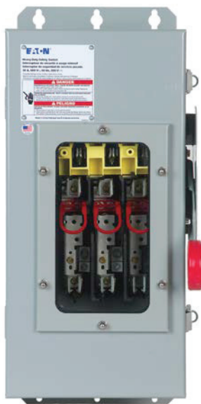
Eaton 30 A and 60 A heavy-duty safety switches feature a vertical viewing window.

Note: Kit includes window gasket, glass, frame, washers, acorn nuts and instruction drawing.