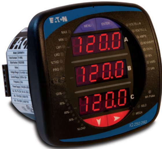
IQ 250/260 Electronic Power Meter

Compact, digital meter delivers high-end power management performance