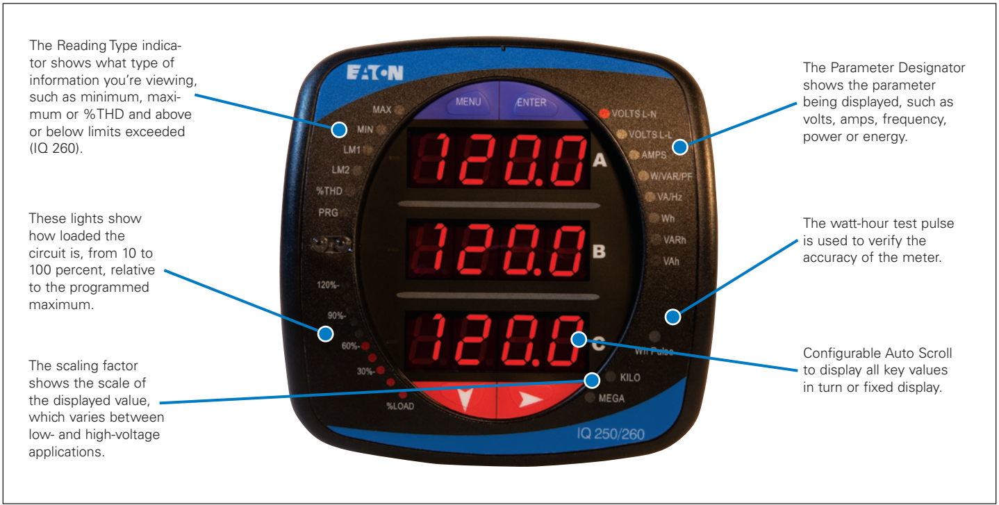
Figure 1 — IQ 250/260 Meter faceplate display