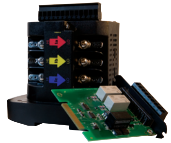
Expandable I/O componentry