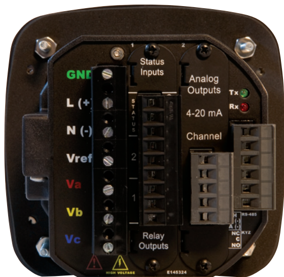
IQ 250/260 Meter (rear view) with connection and communication ports