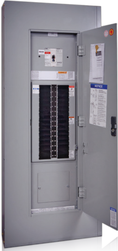
Eaton EZ Panel™ panelboards