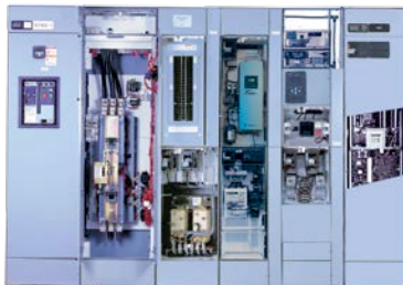
MCC lineups, arc-resistant and communicating MCCs