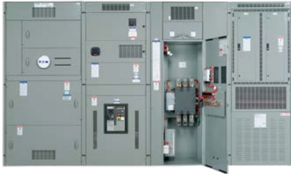
Integrated Facility Systems™ (IFS™)