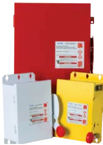
Safety switches and loadcenters