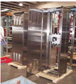
Stainless steel switchboard