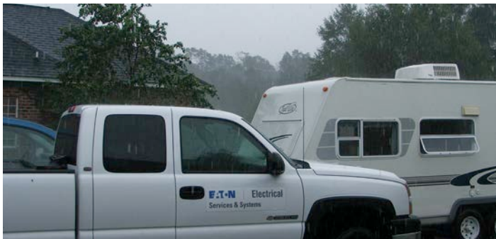
Eaton response teams mobilize quickly to restore operations

With more than 100 locations across the country, our comprehensive portfolio of services is tailored for every stage of a power system's life cycle—whether it's design, build or support. Our services integrate and optimize the elements of a power system to make sure it's aligned with business goals. Please visit us at Eaton.com/EESS for more information.