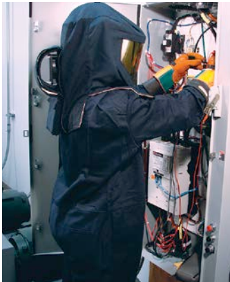
Eaton's significant refurbishment and repair capabilities

Eaton.com/disasterresponse Eaton.com/satellites 24/7 emergency response hotline: 1-800-498-2678