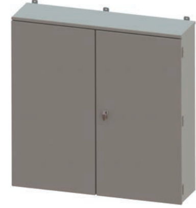
404014 DDHRTCT M2-00 (Duke)