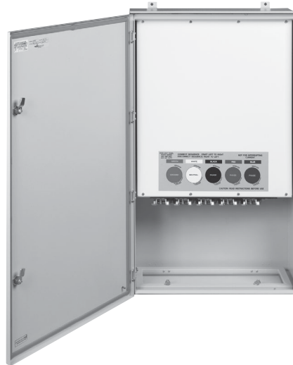
Posi-Max panel in cold rolled steel with epoxy powder paint