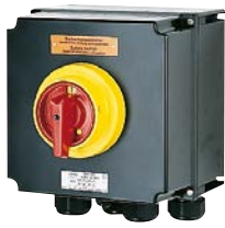
6-pole EMERGENCY STOP