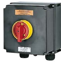
3/4-pole EMERGENCY STOP