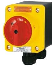
3-pole EMERGENCY STOP