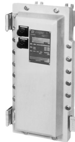
Spectrum EBM motor control enclosures accommodate popular makes of starters.