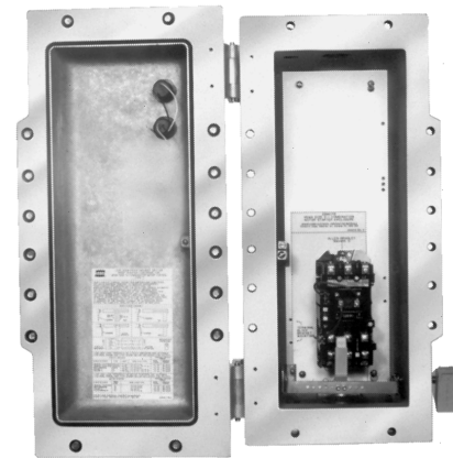
EBMS Series starter enclosures are available with magnetic line starters. NEMA sizes 0-5.

§ Motor starters are furnished with three heaters when heater ratings are fully specified.