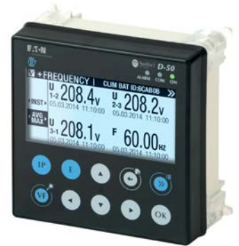
PowerWave BCM end feed display

No, both the PowerWave 2 busway and metering components are designed to be easily installable and scalable.