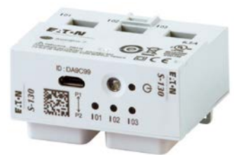
PowerWave BCM monitoring

For more information, visit Eaton.com/powerwave