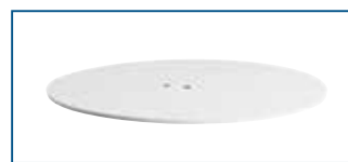
Back cover plate (PELBP)

For more information on the installation requirements and product specifications, please visit our website: https://uk.eaton.com/content/gb/en/products/product-catalog/pello-suspended.html