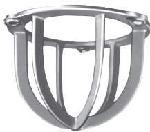
Guard EV503 EV5140