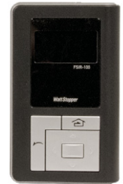
REMOTE CONTROL 1

Occupancy sensor and remote (ordered separately)