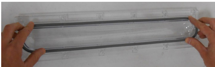
Retaining Rib in Channel/Groove