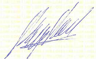
Angel Vega Remesal Head of ATEX area

This supplement must be an inseparable part together with the base certificate LOM 02ATEX2020 X (This document may only be reproduced in its entirety and without any change) This Certificate is a translation from the original in Spanish. The LOM liability applies only on the Spanish text