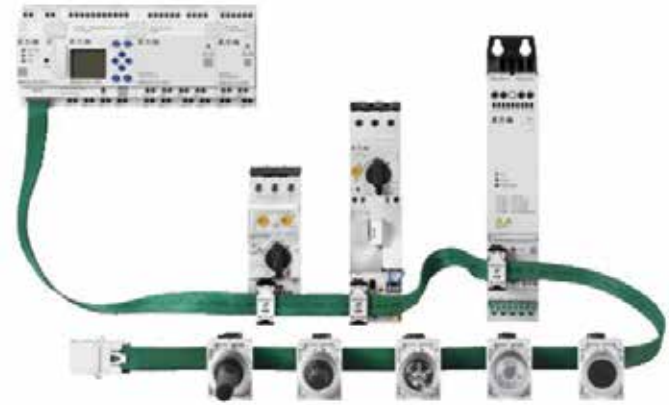
Thanks to the easyE4 communication module, SmartWire-DT devices can now be connected both inside and outside the control cabinet.

Our intuitive easySoft 7 programming software for the 'easy' series can also be used to configure SmartWire-DT devices or the network. For this purpose, we have integrated the functions of the SWD-Assist into the latest version of easySoft, meaning you won't need any additional software. SmartWire-DT components are included in our device catalog, allowing you to use the software to configure entire SmartWire-DT networks simply via "drag & drop." Furthermore, the process of allocating operands to the respective network devices is both simple and saves time.