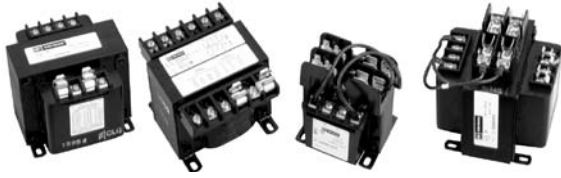
Table 5. Type MTE—Product Selection