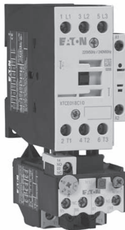
XT Starter with XTOB Thermal OL