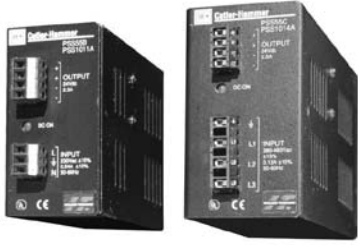
Table 7. PSS Power Supply Selection