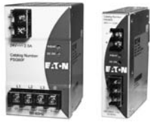
Table 6. PSG Power Supply Selection