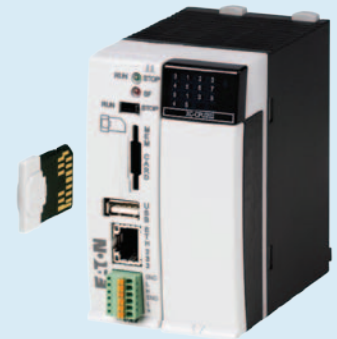
XC202 Controller with Optional SD Memory Card