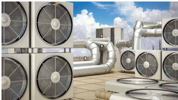
HVAC industry solutions