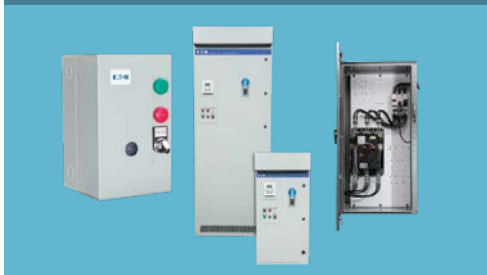
Enclosed starters and VFDs