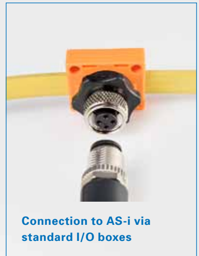
Connection to AS-i via standard I/O boxes