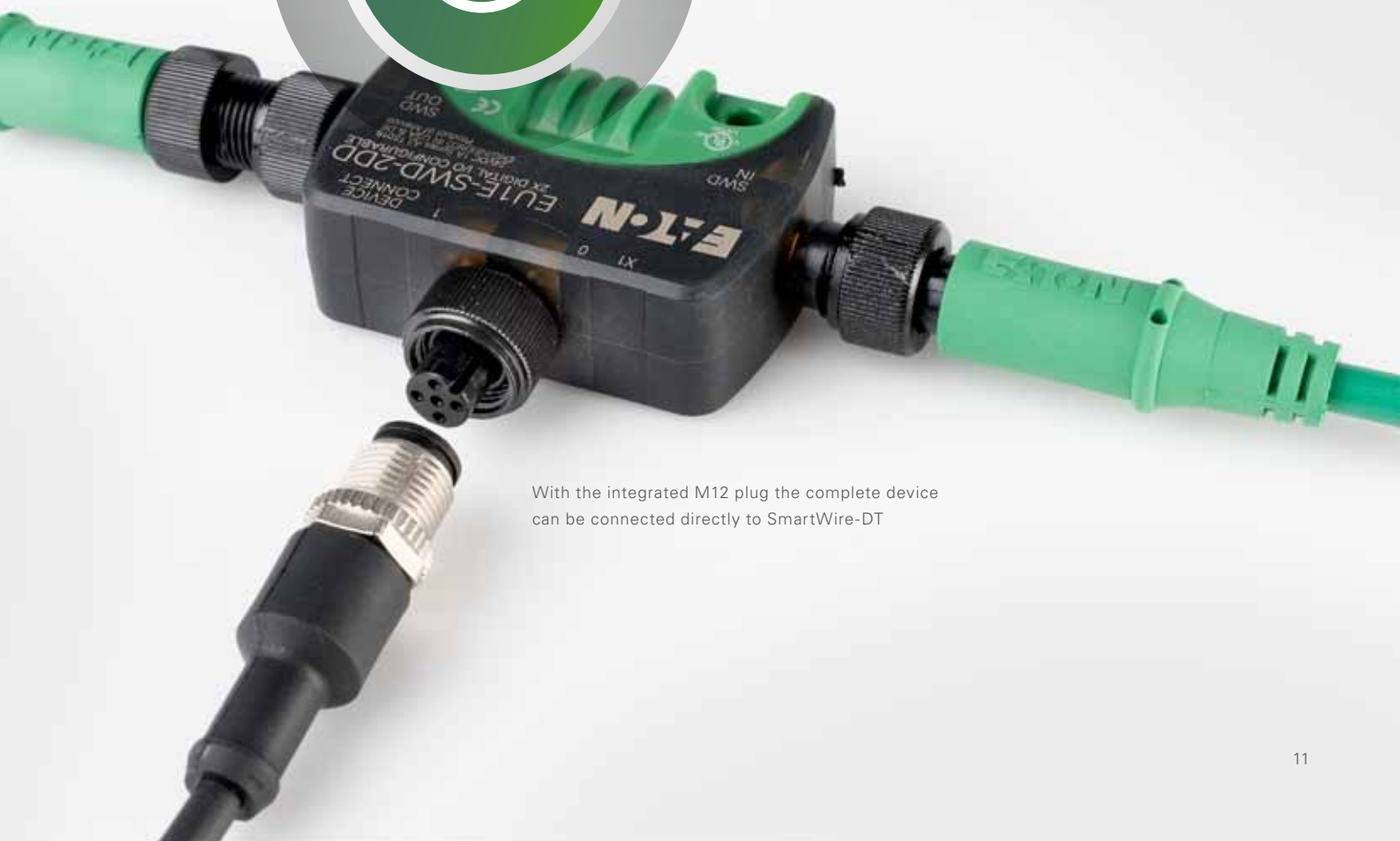
With the integrated M12 plug the complete device can be connected directly to SmartWire-DT