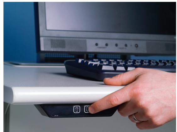
Shown with our LINX product, the lift controls are located at the front edge of the worksurface.

A compact gas cylinder at the back of the monitor mount allows a tilt adjustment of 10° to minimize glare and create a preferred viewing angle. A locking device secures the LCD against tampering and theft.