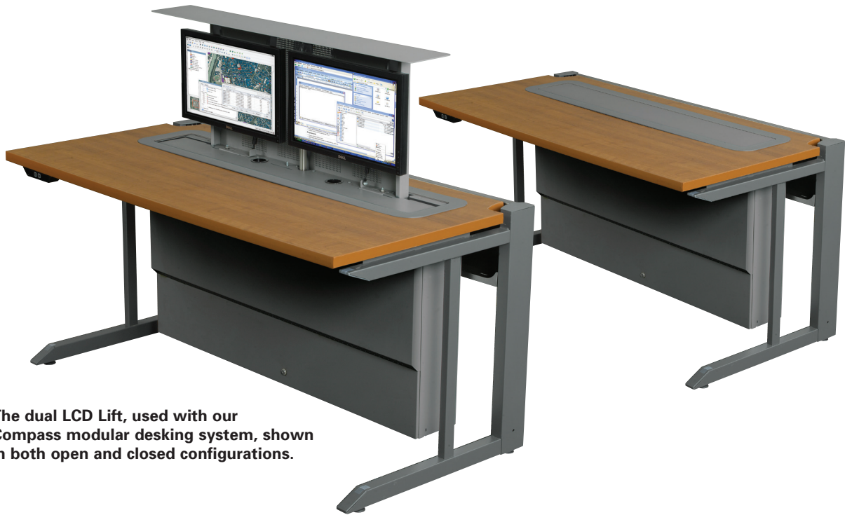
The dual LCD Lift, used with our Compass modular desking system, shown in both open and closed configurations.

The LCD Lift's technology relies on a space-efficient, electro-mechanical mechanism that completely integrates LCD flat panel displays of various sizes (VESA compatible screen mounts). To access the monitor, simply push the "raise" button and your screen will instantly lift with whisper quiet activation. There is no need to operate a crank or wrestle with retractable arms to position the monitor.