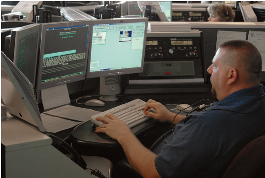
All workstations are designed to accommodate multiple desktop rackmount modules, flat panel displays and emergency flip cards.