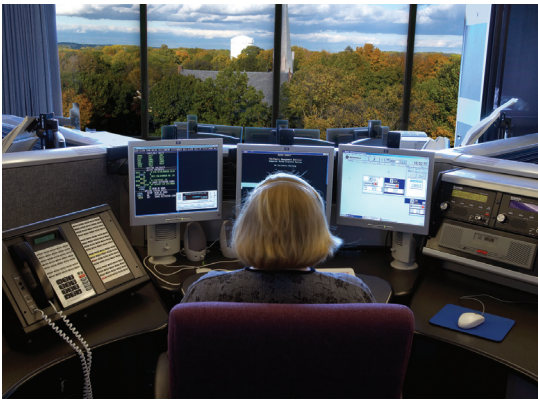
All workstations at Buck's County are designed as stationary with ergonomic integrated keyboard platforms.