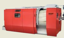
Press system HPX