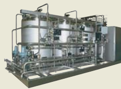
Juice treatment with adsorption