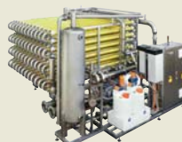
Cross flow filtration