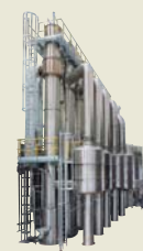
Evaporation and aroma recovery