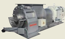
Grinding mill C 25