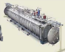
Vacuum or freeze drying