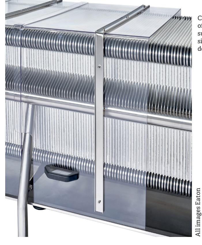
Close-up of spray suppression device

After installing the new Eaton filtration system at the initial production location, the British whisky producer appeared highly satisfied with the results. "Our filtration system offered the customer the optimal solution for its requirements," Henger confirms. Alongside their performance and good sealing, the filter sheets could also be replaced with impressive ease. "The customer was particularly pleased with the effectiveness of the spray