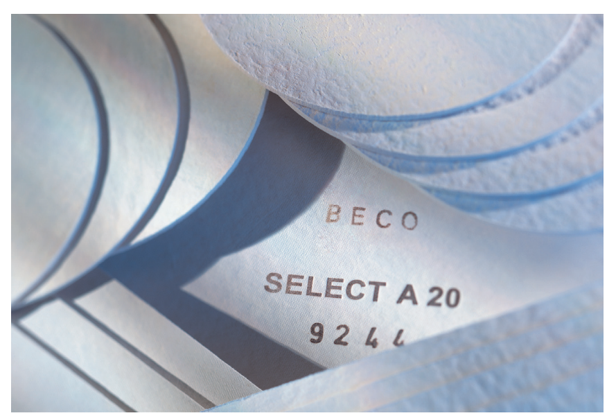
The "Beco Select A" reduced-ion depth filter sheets preserve the high-quality ingredients used in whisky and other spirits. They ensure that the product retains its original color and prevent the filtration process from affecting the quality of taste in the product

suppression device, which ensures the highest level of safety thanks to its robust components," Henger adds. "The customer has expressed their high satisfaction in the form of both referrals and follow-up orders: the customer is using Beco Compact Plate A600 plate and frame filters and reduced-ion "Beco Select A" depth filter sheets in an ever-increasing number of its locations."