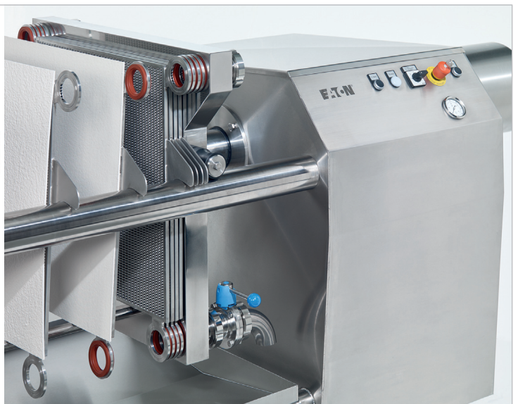
Eaton BECO COMPACT PLATE A600 plate and frame filtration system – A high-quality multi-sheet filter with wide-ranging optional features. The flexible filter surface area can be adapted to an individual application, and drip loss can be reduced to a minimum through the optimized tubular grid exposed on both sides and the hydraulic compressing mechanism with automatic re-tightening.