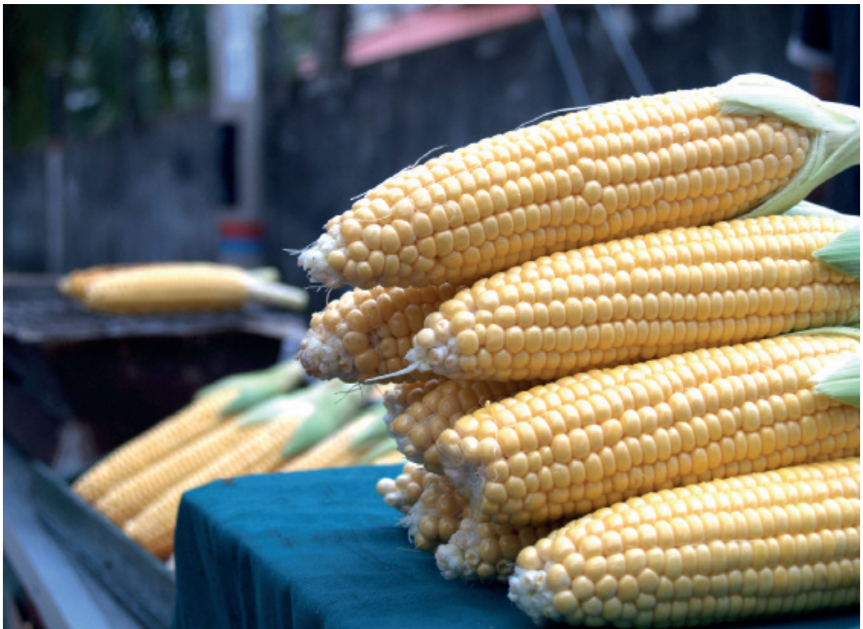
Corn syrup softens texture and add volume to foods.

One of the world's leading producers of corn sweeteners, including corn syrups, high-fructose corn syrups, maltodextrin, crystalline fructose and dextrose,