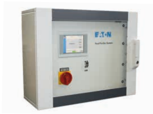
Web-enabled control unit with touch panel and USB interface