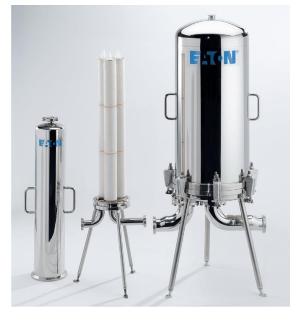
KB housing: 1 to 8 filter cartridges (quick closure)