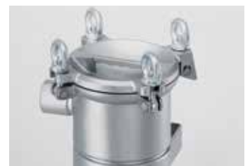
Ergonomic, integral cover handle is easy to open and close