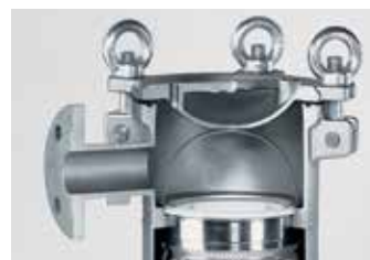
Compression bag hold down creates 360 degree sealing between filter bag and bag filter housing