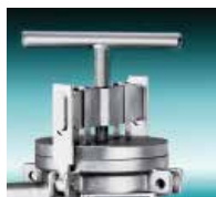
SIDELINE with T-bolt closure (TSBF)

Viton® is a registered trademark of E. I. du Pont de Nemours and company.