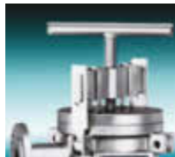
SIDELINE with T-bolt closure (TSBF)

Viton® is a registered trademark of E. I. du Pont de Nemours and company.