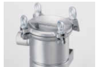
Ergonomic, integral cover handle is easy to open and close