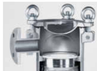
Compression bag hold down creates 360 degree sealing between filter bag and bag filter housing