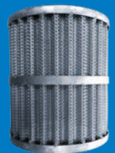
Convoluted perforation or wire mesh element