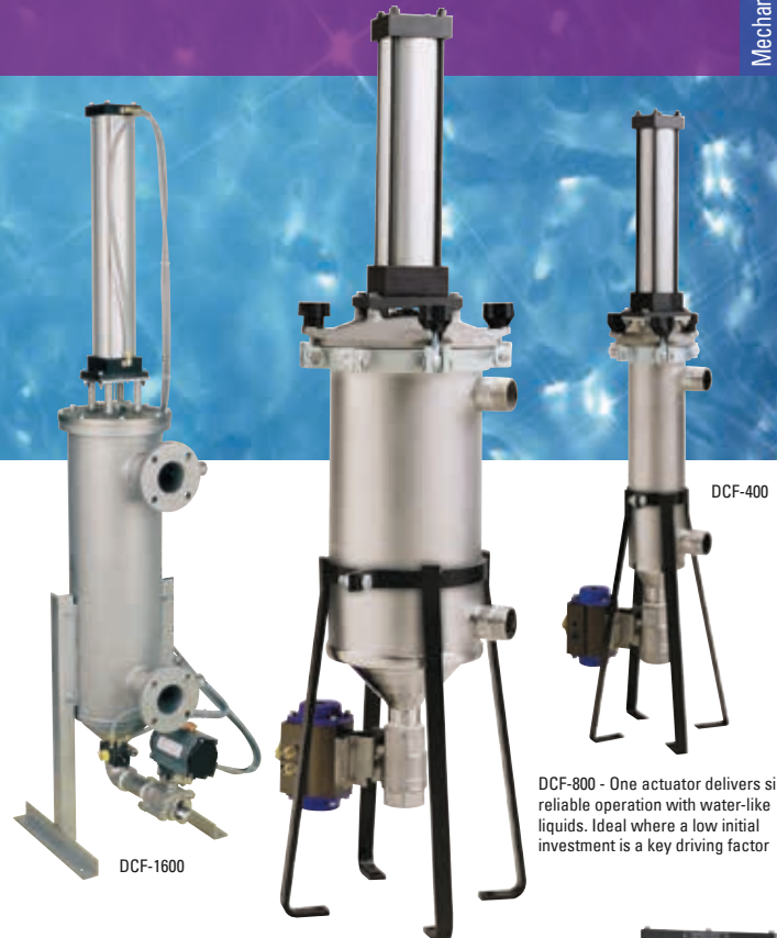
DCF-800 - One actuator delivers simple, reliable operation with water-like liquids. Ideal where a low initial investment is a key driving factor

The Eaton DCF-Series is ideal for highly viscous, abrasive, or sticky liquids. The DCFs operate at a consistently low differential pressure and deliver simple, reliable operation in which a low initial investment is a key driving factor.