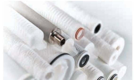
Read more on the success story of metal parts cleaning on www.eaton.com/filtration

Eaton's industrial process filter cartridges provide consistent, high performance and cost-effective solutions for both common and more challenging industrial applications, varying from pre-filter for high purity water up to final filtration for paints and lacquers, or total filtration for various chemicals.