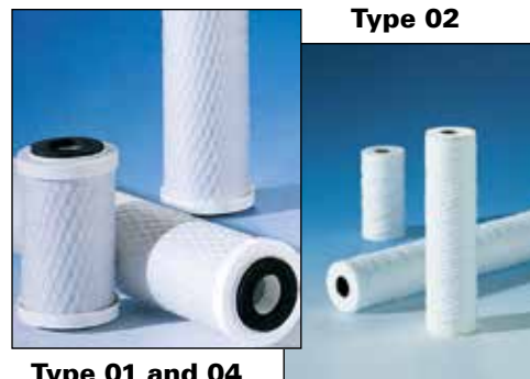
Type 01 and 04

Retention ratings 2 -1: 1 µm -2: 5 µm -3: 10 µm