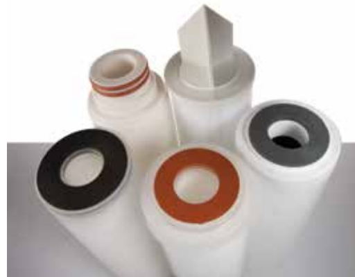
LOFPLEAT GG filter cartridges are available with a variety of gasket, O-ring and end cap configurations.

* For liquids other than water, multiply pressure drop by fluid viscosity in centipoise.