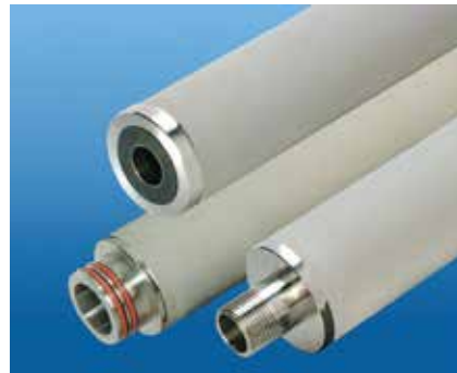
LOFMET filter cartridges are available with a variety of gasket and end cap configurations.

The micron ratings shown at various efficiency and beta ratio value levels were determined through laboratory testing, and can be used as a guide for selecting cartridges and estimating their performance. Under actual field conditions, results may vary somewhat from the values shown due to the variability of filtration parameters. Testing was conducted using the single-pass test method, water at 3 gpm/10" cartridge (9.45 l/min). Contaminants included latex beads, coarse and fine test dust. Removal efficiencies were determined using dual laser source particle counters.