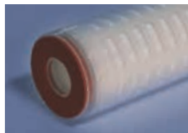
Code DOE: Double open end (DOE) with flat gaskets (only LOFPLEAT, LOFMEM and LOFMET)