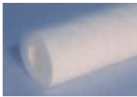
Code (): Double open end (DOE) without end caps (only LOFTREX and LOFTOP)