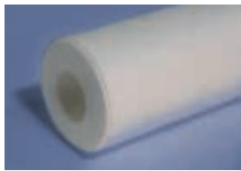
Code G: Double open end (DOE) with foamed Polypropylene flat gaskets (only LOFTREX and LOFTOP)