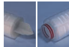
Code 2: Single open end (SOE) with adapter (2-222 O-ring) and end cap with fin