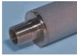
Code M1 and M2: Single open end (SOE) with 3/4" male NPT threaded end (Code M1) respectively 1" male NPT threaded end (Code M2) (only LOFMET)