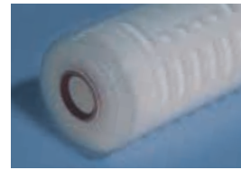
Code 10 and 20: Double open end (DOE) with internal O-ring (Code 10); Single open end (SOE) with internal O-ring (Code 20)