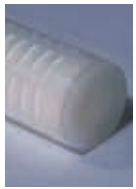
Code 4: Single open end (SOE) with adapter (2-222 O-ring) and flat end cap