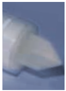
Code 3: Single open end (SOE) with double bayonet adapter (2-226 O-ring) and end cap with fin