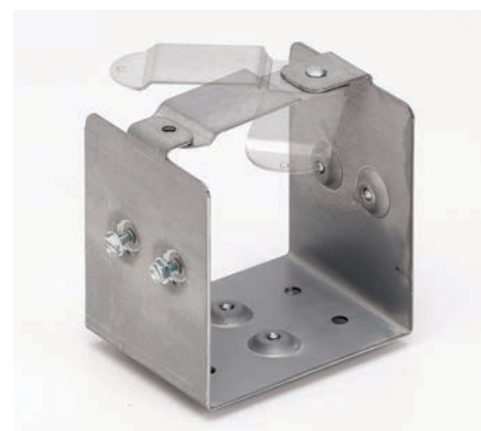
Swing gate wireway connector with pre-installed hardware