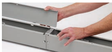
Install and secure hinged covers