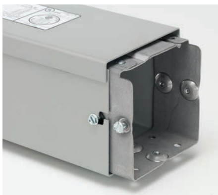
Quick-Connect wireway solution

When it comes to B-Line's series Quick-Connect™ wireway installation method over traditional wireway installations, tests conclude an installation savings of up to 20% driving down overall cost of install.