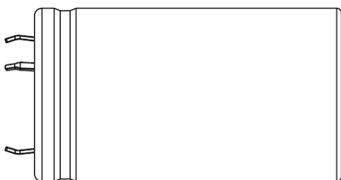
Current Cell Shape

The Eaton PowerStor XB and XV Series supercapacitors are receiving a visible change. This change involves adding a groove around the circumference at the center of the length, as shown in the illustration below.