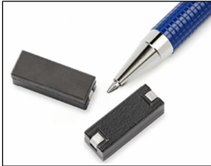
FP2207R1-R230-R Rev A