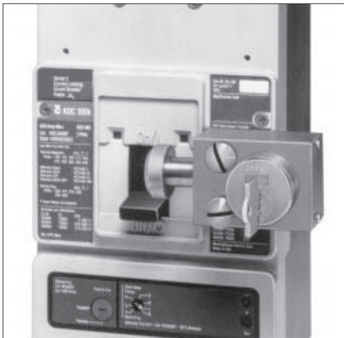
Figure 1-1 Key Interlock Installed on Series C Circuit Breaker (K-Frame Shown).

The user is cautioned to observe all recommendations, warnings, and cautions relating to the safety of personnel and equipment as well as all general and local health and safety laws, codes, and procedures.