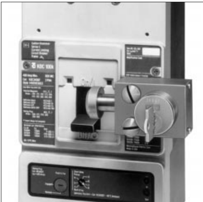
Figure 1-1 Key Interlock Installed on Series C Circuit Breaker (K-Frame Shown)

The user is cautioned to observe all recommendations, warnings, and cautions relating to the safety of personnel and equipment as well as all general and local health and safety laws, codes, and procedures.