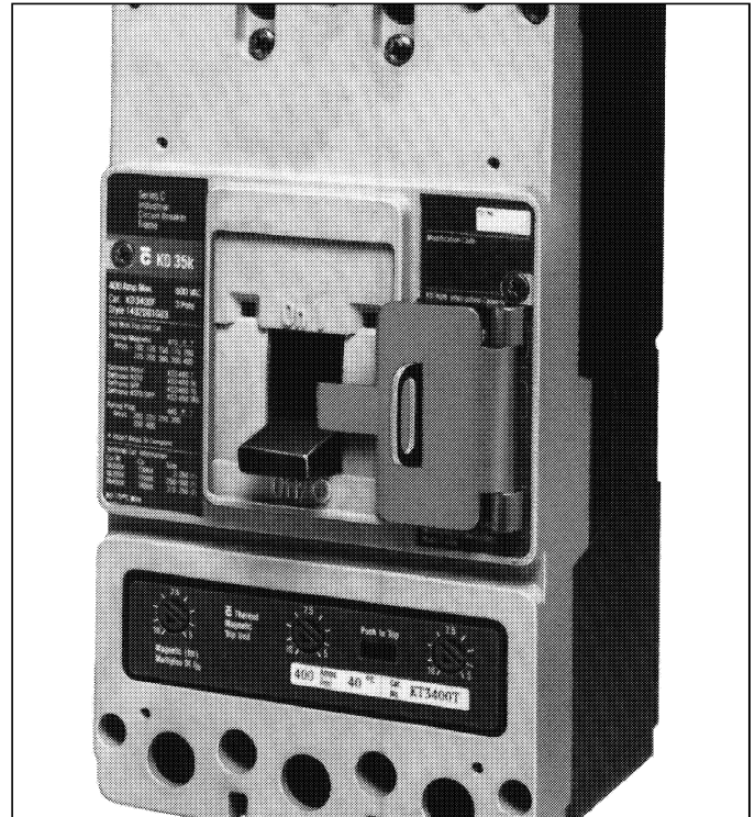
Fig. 1-1 Padlockable Handle Lock Hasp Installed on Series C Circuit Breaker (K-Frame Shown)

This instruction leaflet (IL) gives detailed procedures for installing the padlockable handle lock hasp.