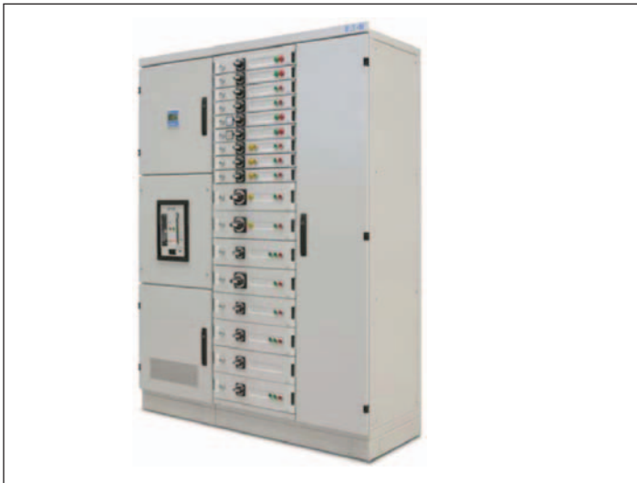
Figure 2. Low Voltage Metal-Enclosed Controlgear Manufactured to IEC Standard 61439

Likewise, a typical assembly rated at three-phase 380 to 415 Vac as applied in markets outside of North America is shown in Figure 2 . The assembly shown is low voltage metal-enclosed controlgear, which is manufactured and tested to the International Electrotechnical Commission (IEC) Standard 61439 [4]. Again, this standard dictates the design and test requirements for circuit breakers and control equipment including arc rating requirements as defined in the standard.