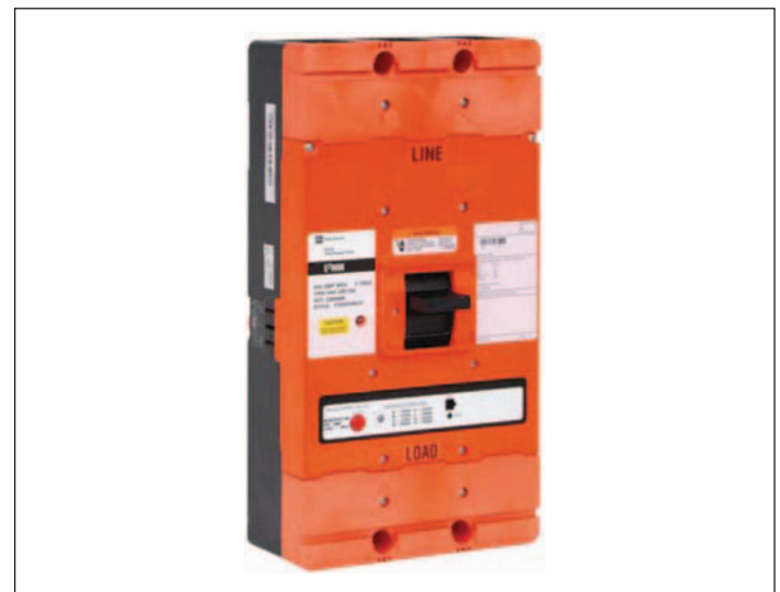
Figure 5. 1000V, 800A Molded-Case Circuit Breaker Designed and Tested for Underground Mining Applications

Note: This circuit breaker is tested for application at 1000 Vac. The manufacturer includes an orange molded-case cover plate, designating the product is designed for mining industry applications.