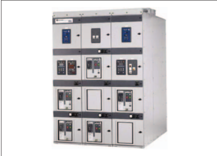
Figure 1. Low Voltage Metal-Enclosed Switchgear Manufactured to ANSI/NEMA Standard C3720.1

In this case, ANSI/NEMA Standard C3720.1 [2] dictates the design and test requirements for this assembly, including low voltage power circuit breakers that are manufactured and tested to a similar standard. This assembly can also include an arc-resistant rating when it is manufactured to another “adjacent” test standard, ANSI C3720.7 [3]. This standard defines design and testing requirements to ensure an arc-flash event is channeled or redirected up and away from personnel working on or near the assembly while it is energized.