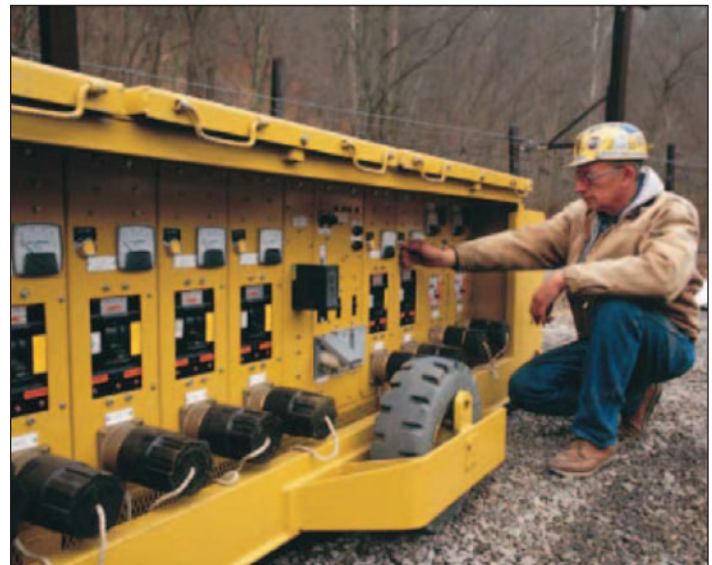
Figure 3. Low-Profile Underground Power Center Including Primary Fused Switch, Transformer, and Low Voltage Circuit Breakers