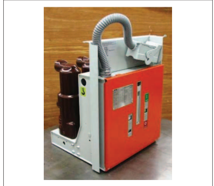
Figure 7. New Design Fixed-Mount Vacuum Circuit Breaker Applied in 1.2 kV Low Voltage and up to 24 kV Medium Voltage Underground Mining Systems

The impact of these changes in underground electrical systems is an upward pressure on circuit breaker designs. MCCBs that have been applied at 1000 Vac with full load current ratings of 150, 250, 400, 600, 1200, and 2000A with interrupting current ratings from 10 kA to 25 kA are now being used to operate at higher operating voltages from 1.2 kV up to 3.3 kV with interrupting ratings to 25 kA and beyond. Circuit breaker manufacturers are pushing the limits of MCCB design. MCCBs employ arc interruption in air via a proven technology that draws an arc developed across opening contacts into an arc-chute that divides the arc into several smaller components, eventually cooling and extinguishing it to interrupt a fault. Higher rating requirements are pushing the physics of the ability to successfully interrupt an arc in air. This opens the door to other circuit interruption methods including vacuum and SF 6 designs that must be considered. Figure 7 shows one available vacuum circuit breaker, a new design presently being introduced into underground mining applications.