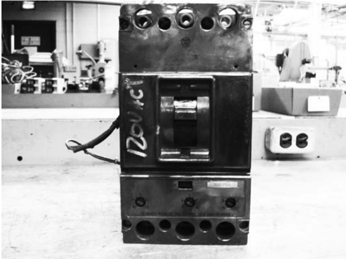
Figure 4. Third-Party Refurbished Breaker Without Nameplate or Product Identification

A similar looking breaker from a third party was tested. This breaker appeared like Eaton's HKA; however, it had no nameplate or catalog information to properly identify it or its ratings. The breaker's ratings were assumed to be those of the Eaton HKA design, and it was subjected to the high interruption test. When the breaker was first closed, there was no continuity in the center and right poles, which prevented it from being calibrated. It failed the first high fault interrupting test, with the cover separating from the base, and the laboratory backup breaker cleared the fault (see Figure 4 and Figure 5 ). The sample third-party breaker is in worse condition than the comparable newly manufactured Eaton breaker after the same test ( Figure 3 ).