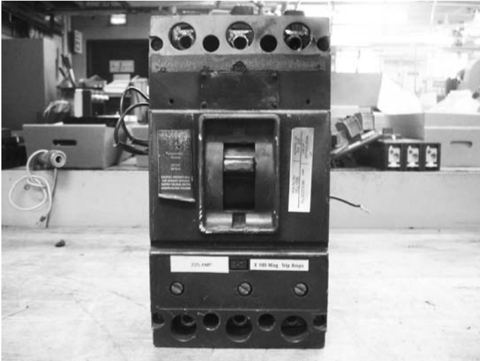
Figure 8. Third-Party Refurbished Breaker Failed to Interrupt on Short-Circuit Test

The unit was believed to be an HKA; the sample was tested for endurance based on Eaton's published data for the HKA frame. The third-party sample passed initial calibration, but failed the endurance test when the ground fuse opened during the load operations at the rated current. After the ground fuse opened, the center pole of the breaker did not have continuity when closed. Figure 10 and Figure 11 depict the third-party breaker after testing.