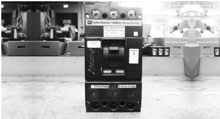
Figure 18. Eaton Production Breaker Shown After Testing; it Passed the Entire Test Sequence with No Issues