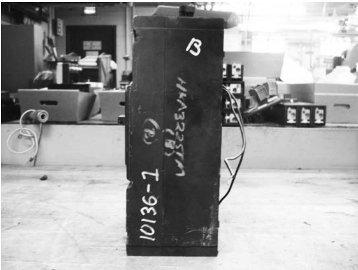
Figure 9. Wires Welded to Terminals After Excess Current Traveled to the Ground