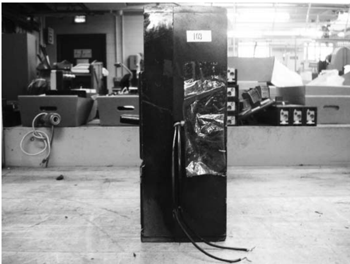
Figure 13. Breaker Did Not Stay Closed During Temperature Testing, Indicating Incorrect Calibration