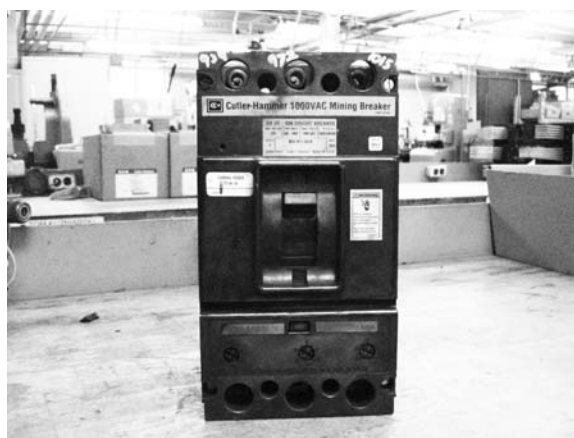
Figure 3. Eaton Manufactured Mining Breaker with Proper Identification and Labeling; Successfully Passed Testing Sequence