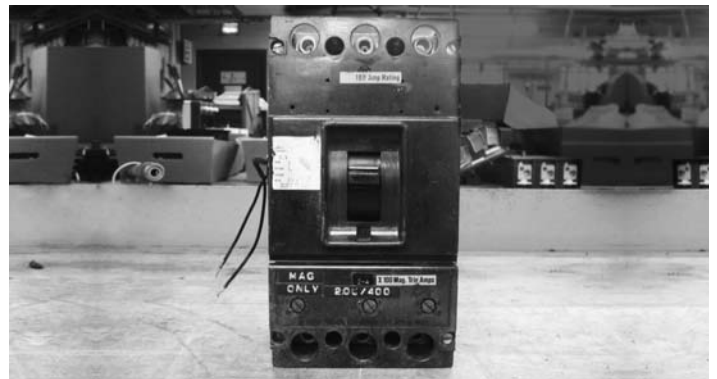
Figure 14. HKAM Mining Breaker Modified by Third-Party Refurbisher

A sample third-party modified HKAM breaker was subject to the endurance testing and compared to an Eaton HKAM circuit breaker from current production. The third-party refurbished breaker had a malfunctioning undervoltage release (UVR) that would not stay engaged with the full rated 120V applied to it. Consequently, it would not remain latched and the breaker could not be closed; Figure 14 and Figure 15 are photographs of the third-party breaker after testing. In contrast, the Eaton newly manufactured breaker passed every portion of the testing procedure, which includes pre-calibration, endurance operations, a low-level interruption, post-calibration, and dielectric withstand. Figure 16 is an image of the Eaton production breaker after testing. Eaton tests the pickup and dropout voltage of each UVR to ensure that the accessory functions properly when installed in the circuit breaker.