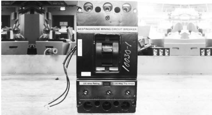
Figure 17. Third-Party Refurbished HKA Breaker with Poor Quality, Homemade Labels; the Breaker Failed to Trip on Overload Test

Conversely, new Eaton HMA circuit breakers meet stated ratings and perform to published specifications.