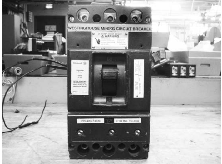
Figure 10. Third-Party Refurbished Breaker After Failing Load Endurance Test