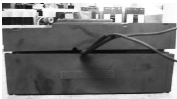
Figure 2. Breaker Cover Separated from Base During High Fault Test