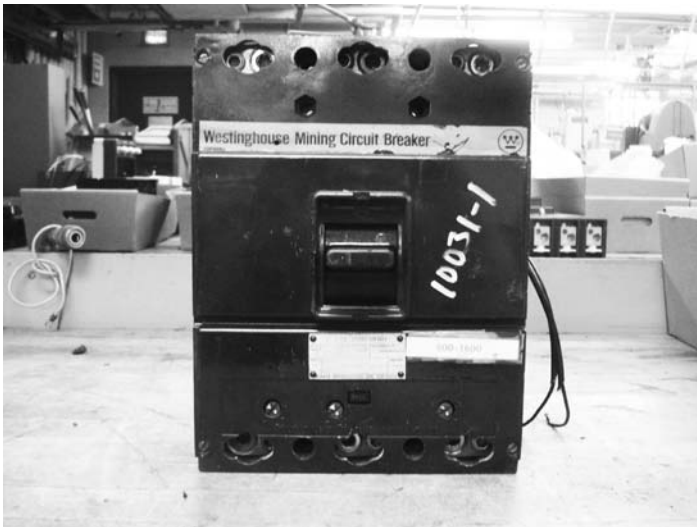
Figure 12. Third-Party Refurbished Mining Breaker with Limited Nameplate Information

In this test, the third-party unit appeared similar to Eaton's LAM circuit breaker, but the nameplate had limited information. It was tested in accordance with the calibration test procedures. The third-party breaker tripped below the maximum time limits in 200% single-pole and 135% three-pole initial calibration tests and passed the overload portion, but it failed to remain closed during the temperature rise test at 100% of rated current. The breaker tripped before its temperature stabilized. The results indicated that the thermal release on the third-party sample was not properly calibrated; the error was likely to result in nuisance tripping. Eaton's production test procedures require trip units to be calibrated so that breakers will not trip before temperatures are stabilized at 100% of the rated current in their designated ambient temperature. Figure 12 and Figure 13 are photographs of the failed refurbished breaker after the test.