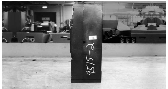
Figure 15. Undervoltage Release Accessory Malfunctioned; Breaker Could Not be Reclosed