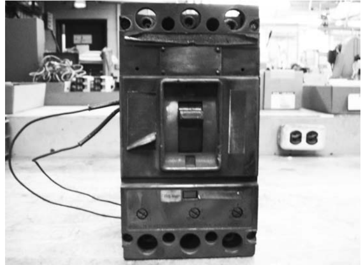
Figure 6. Third-Party Refurbished Breaker Shown Post-Testing; No Nameplate Provided

Another sample modified breaker, type HKA, was tested in the high interruption test at 480V, 60 Hz, with 35,000A available. The third-party sample failed the first high fault interruption test, with the base separating from the cover and the lab back-up breaker clearing the fault. The wires were pulled out of the left and center poles. The third-party sample is again in much worse condition than the new Eaton sample, even after the Eaton breaker endured a second fault interruption test. Figure 6 shows the third-party unit after testing, and Figure 7 shows that the A and C phase line conductors (on top) overheated and the material melted off.