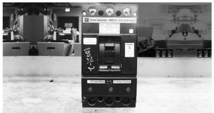
Figure 16. Eaton Manufactured Breaker; Undervoltage Release is Tested for Proper Operation