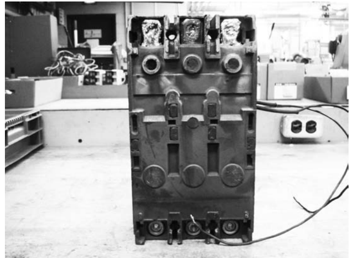
Figure 7. Breaker After High Fault Test; Conductor Material Overheated and Melted Away