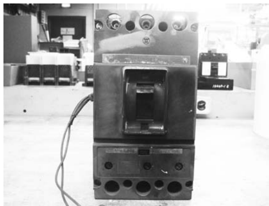
Figure 1. HKA Breaker Repaired by Third-Party Refurbisher, Following Testing

An HKA labeled third-party breaker was tested and compared to a new Eaton circuit breaker. The third-party breaker failed to trip on time in pre-test calibration, and then received its first high-level fault-interrupting test, which resulted in the center pole cable pulling out of the breaker, and the cover separating from the base (see Figure 1 and Figure 2 ). The test breaker failed to interrupt the fault in time, so the laboratory backup breaker had to clear the circuit. The refurbished breaker was unable to attempt a second interruption. Eaton's new breaker received both high-current faults and is in notably better condition post-interruption ( Figure 3 ) than the sample third-party modified breaker, pictured in Figure 1 and Figure 2 .