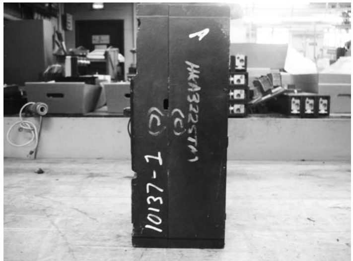
Figure 11. After Failure, Breaker Lost Continuity in the Center Pole