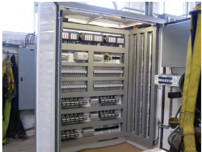
PLC panel for small hydro

The final step is to perform system commissioning, to verify that all system components are wired correctly, that field devices are working as desired, and that all PLC/HMI programming is correct. Detailed point-to-point wiring checks from the field devices back to the PLC, HMI, and (if appropriate) SCADA should be performed in a controlled and methodical fashion. This “end-to-end” test proves that the individual components are working correctly and that the system as a whole is performing as expected.