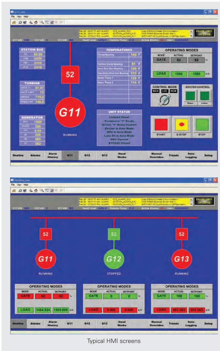
Typical HMI screens

Regulators were calling for the installation of large and expensive valves at a small hydro station in northern Vermont, to provide bypass flow around the station after a utility trip. Due to the location of the plant and the nature of the interconnection, this facility was often knocked offline due to line conditions. As an alternative to bypass valves, the plant implemented a solution that in effect used the turbines as valves to provide the necessary bypass flow after a trip. Basically after an electrical trip, generators were automatically brought to "Speed No Load" and were held there pending further commands. This allowed the plant to quickly restore downstream flow even if the units could not be brought back online. With the line fault condition cleared, the units could quickly be placed back online to start production.