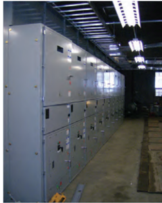
Arc-resistant generator switchgear for an eight-unit hydro