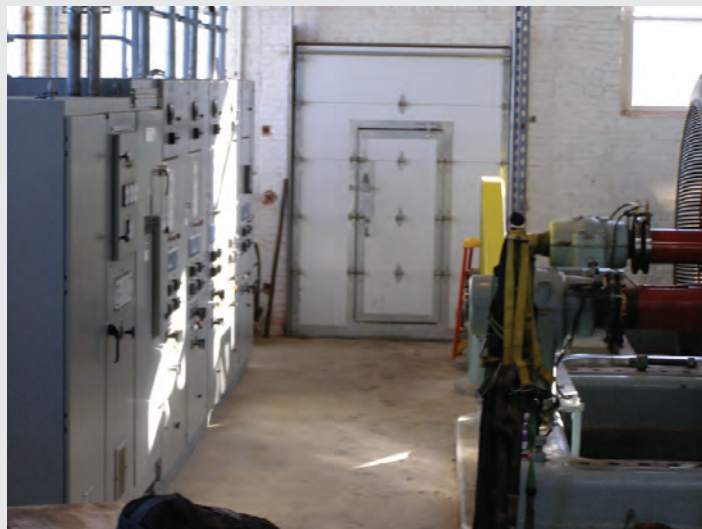
Example of a repowered small hydro using front-access medium voltage switchgear before and after