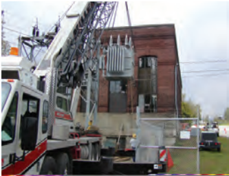
Rigging a new GSU transformer

One project manager should be responsible for coordinating all activity onsite to ensure that each group (mechanical, electrical, civil) has the time and access required to efficiently perform their scope of work.