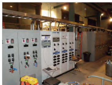
Typical small hydro upgrade, protection, and controls

For synchronous machines, synchronism check relays should be applied and an auto synchronizer is recommended. The sync-check relay should supervise the generator breaker closing for either manual or automatic synchronizing. Motor starters or contactors should not be used in synchronous machine applications.