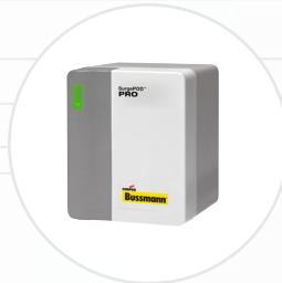
Surge protective devices