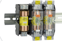
Power distribution fuse blocks