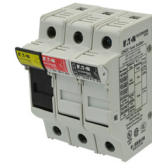
Panel-mount fuse holders